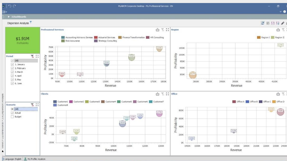
Dashboard: Dispersion Analysis